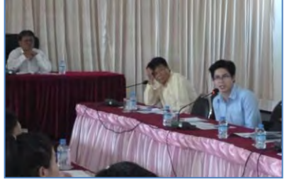
Photo 5 Trial Workshop for Medium-Term Public Investment Plan, Champassak Prov.; March 2013

The project revised a draft mid-term public investment plan and financial management guidelines based on the results of the joint seminar, and with monitoring organizations; Champassak Province; MAF, and MPWT; tested whether the templates are easy to complete. Such tests were conducted in Oudomxay Province as well. The project managed to get the monitororganizations' agreement on the objectives and contents of mid-term public investment plan and financial management guidelines, while some issues were raised as follows.