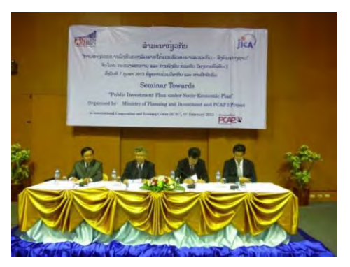
Photo 4 Joint Seminar on the Mid-Term Public Investment Plan & Financial Guidelines; Feb. 2013

management were accepted by the participants. Major comments were as follows.